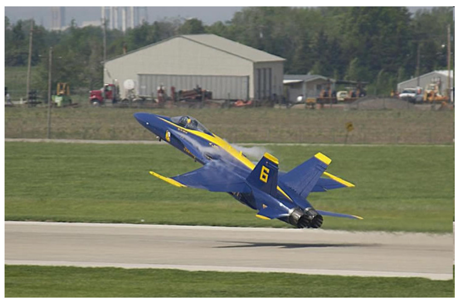
The U.S. Navy Blue Angels