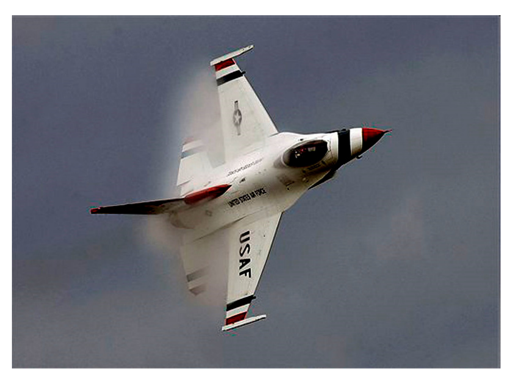
The U.S. Air Force Thunderbirds perform a special maneuver