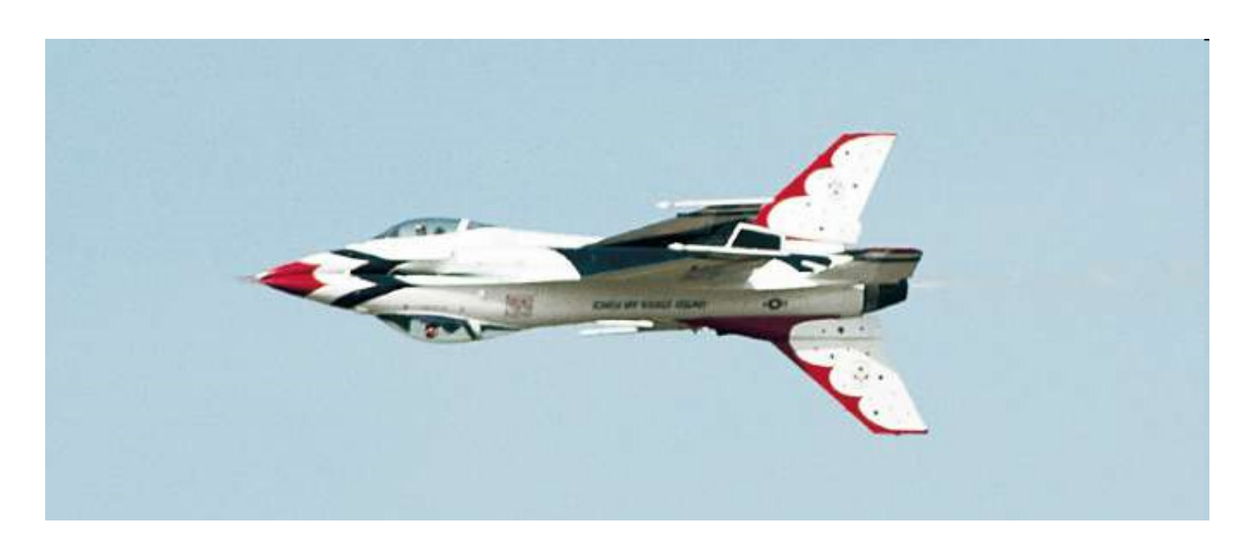
The U.S. Air Force Thunderbirds perform a "reflection" maneuver