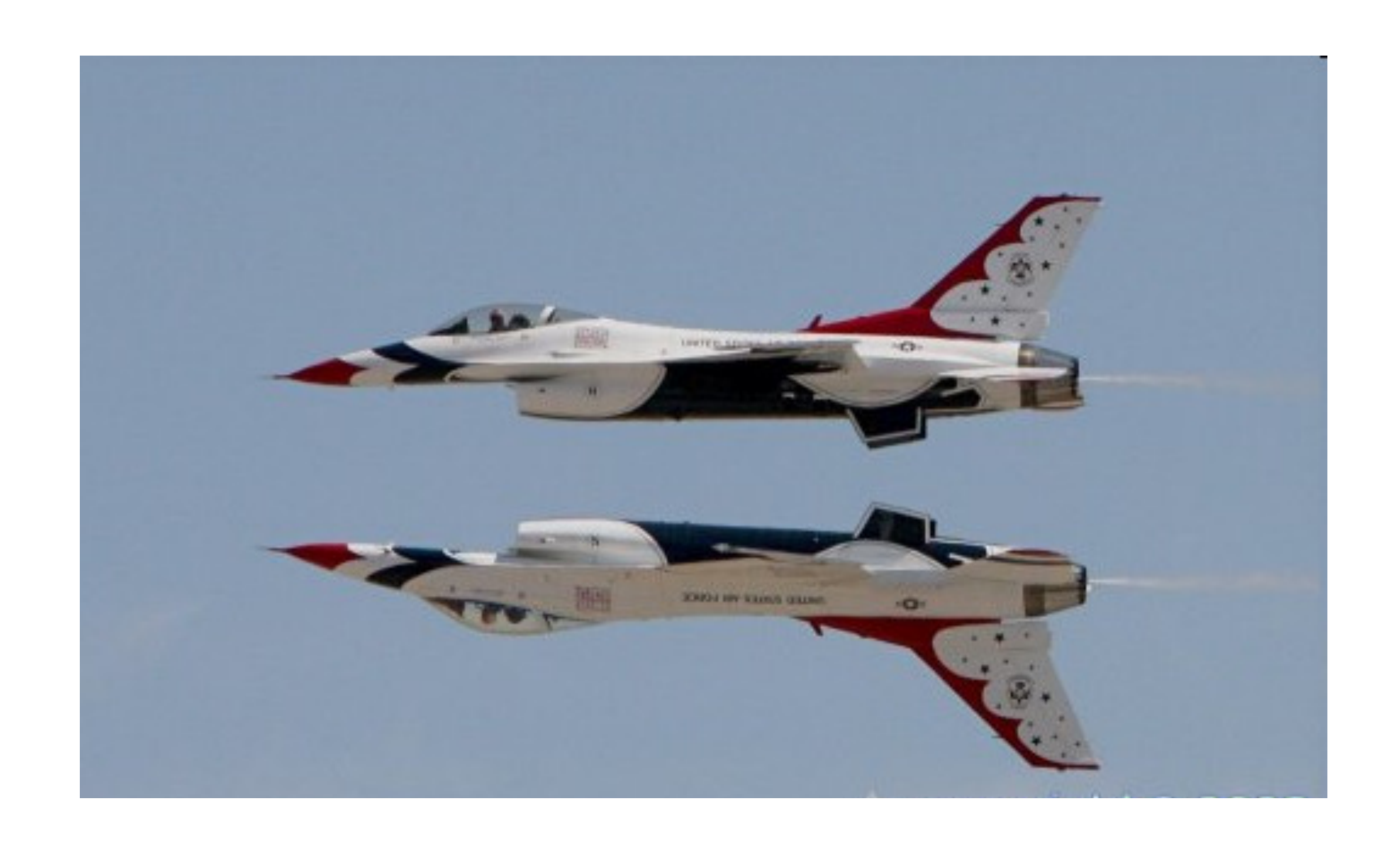
The U.S. Air Force Thunderbirds perform a "reflection" maneuver