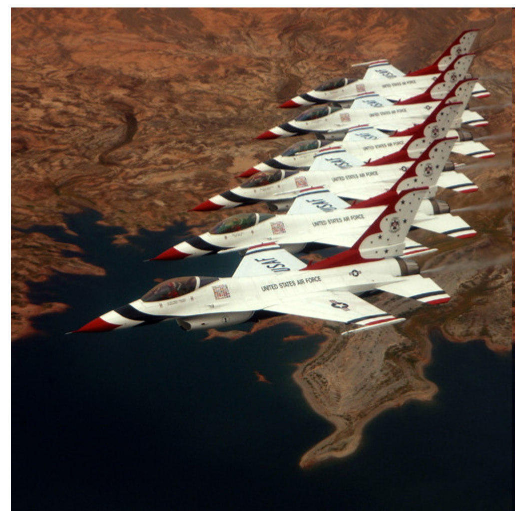
The U.S. Air Force Thunderbirds perform a special maneuver