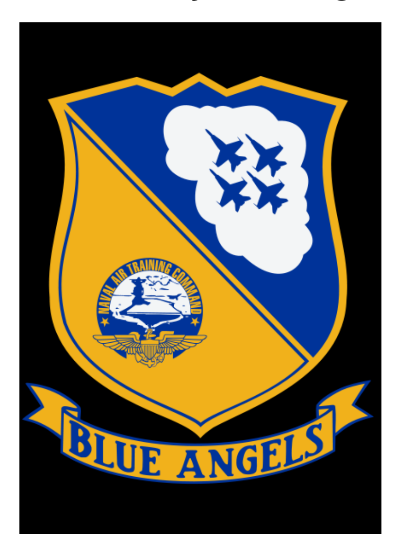
The U.S. Navy Blue Angels