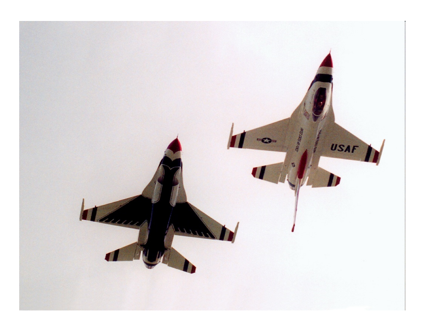
The U.S. Air Force Thunderbirds