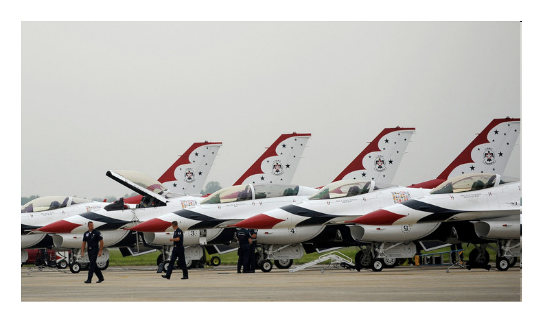
The U.S. Air Force Thunderbirds