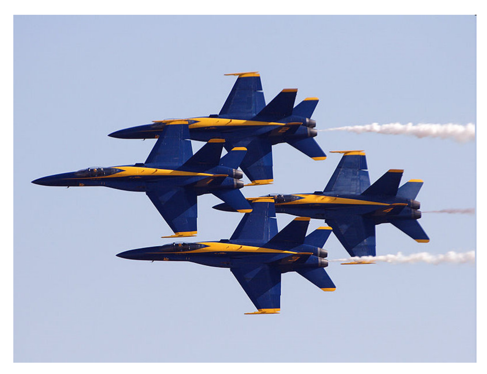
The U.S. Navy Blue Angels