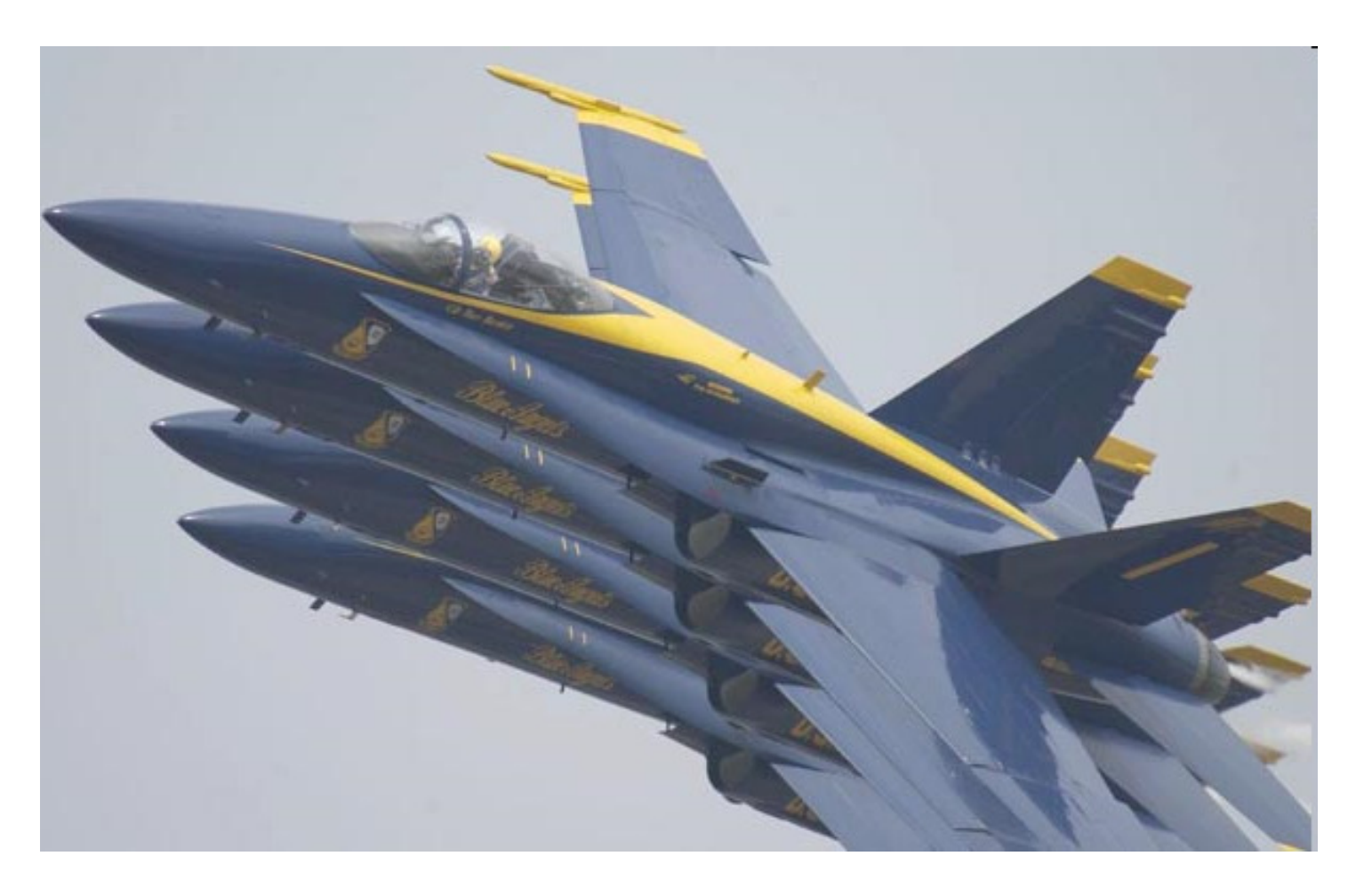
The U.S. Navy Blue Angels