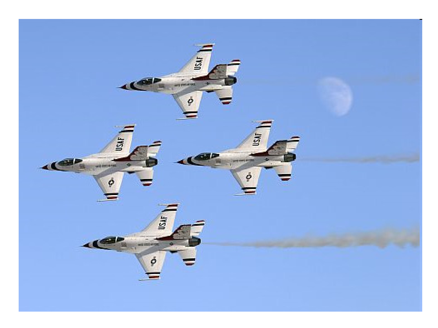
The U.S. Air Force Thunderbirds