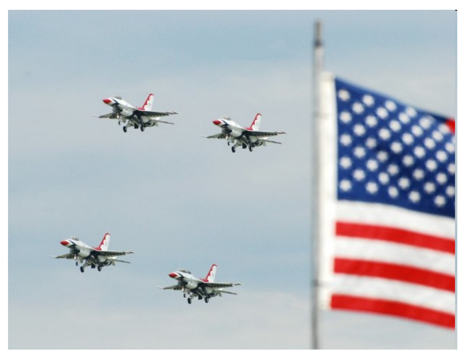
The U.S. Air Force Thunderbirds perform a special maneuver