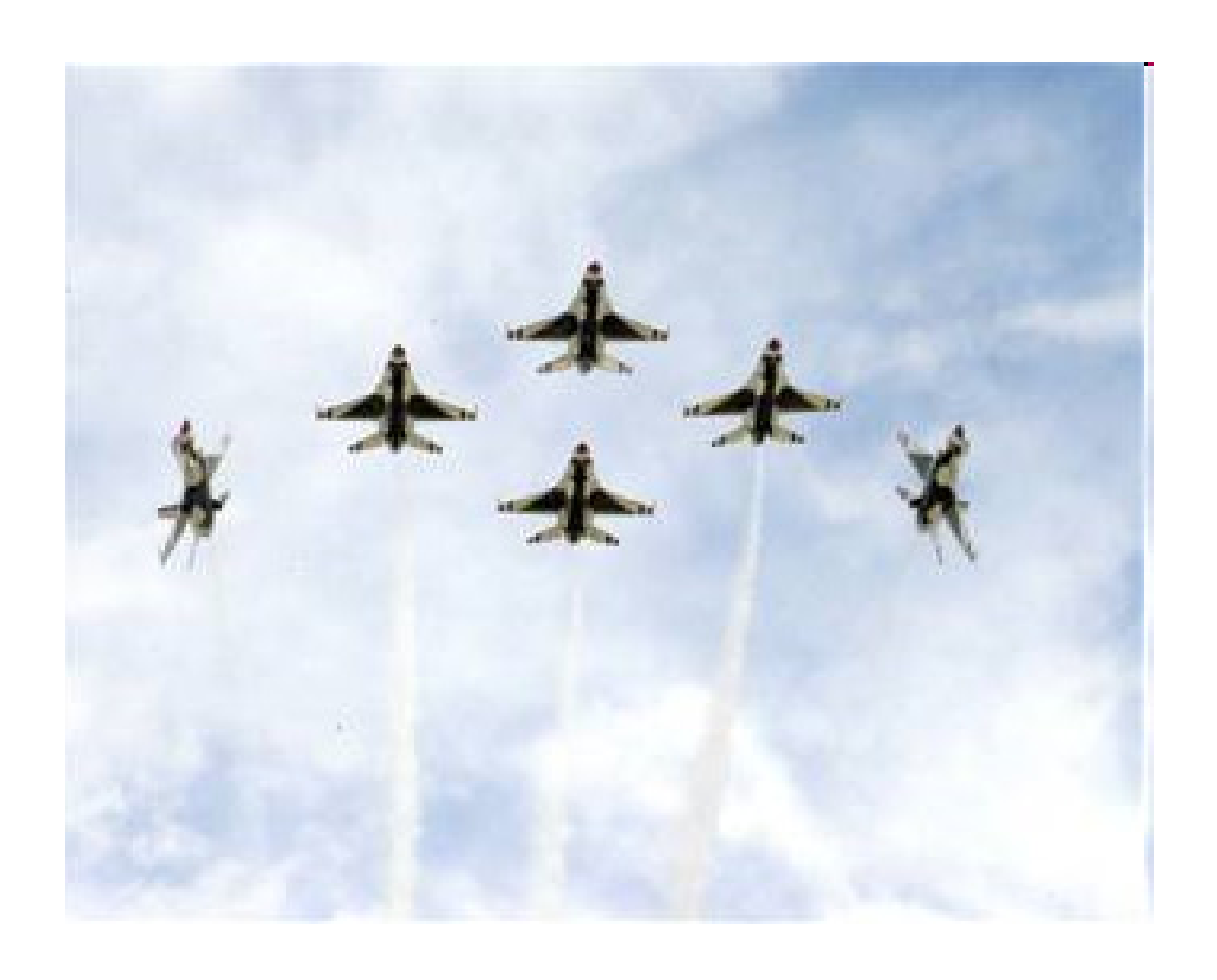
The U.S. Air Force Thunderbirds perform a special maneuver