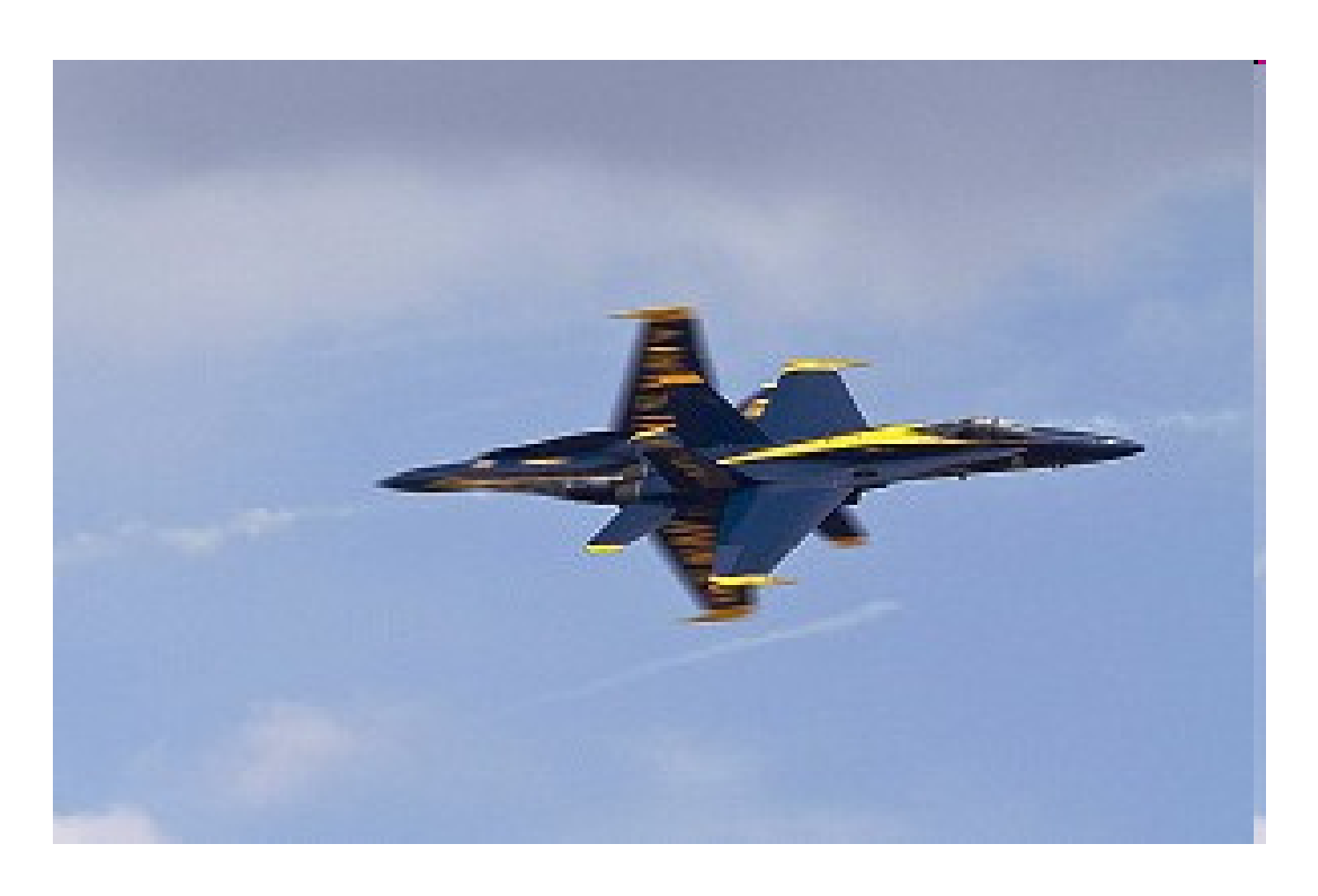
The U.S. Navy Blue Angels