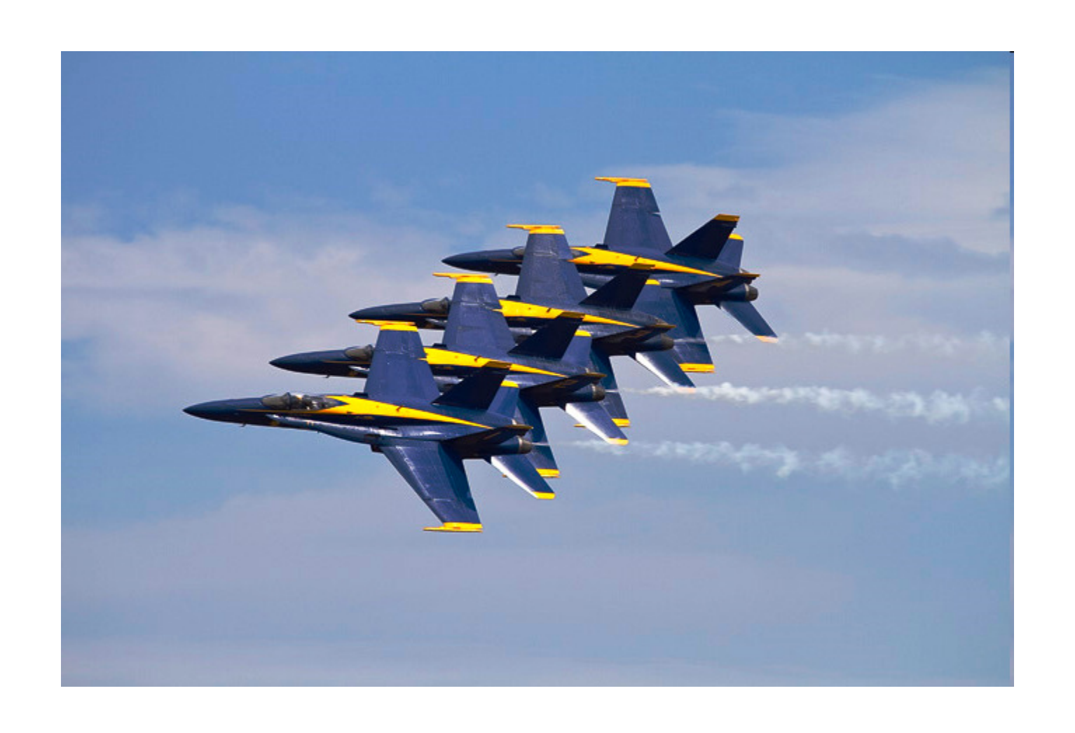
The U.S. Navy Blue Angels