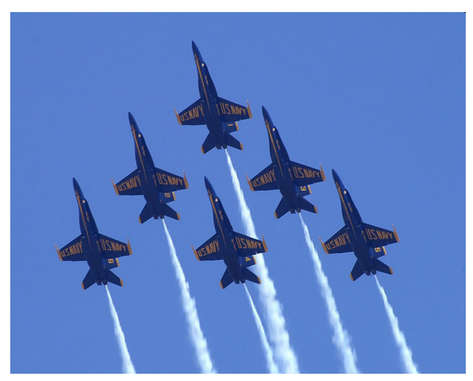
The U.S. Navy Blue Angels