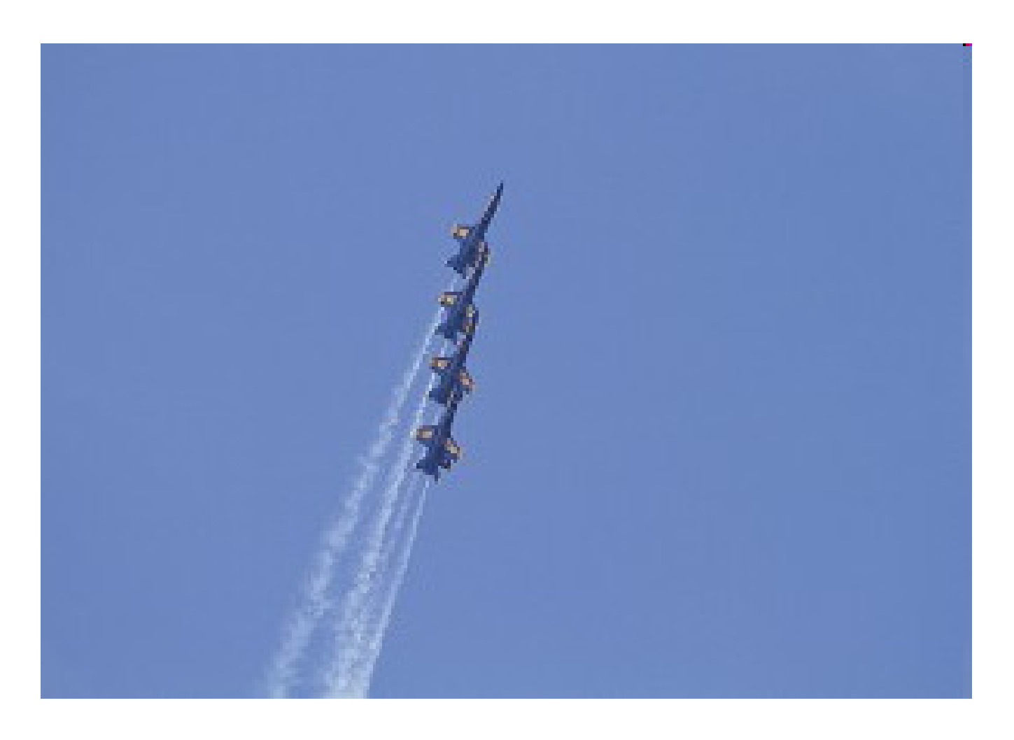
The U.S. Navy Blue Angels