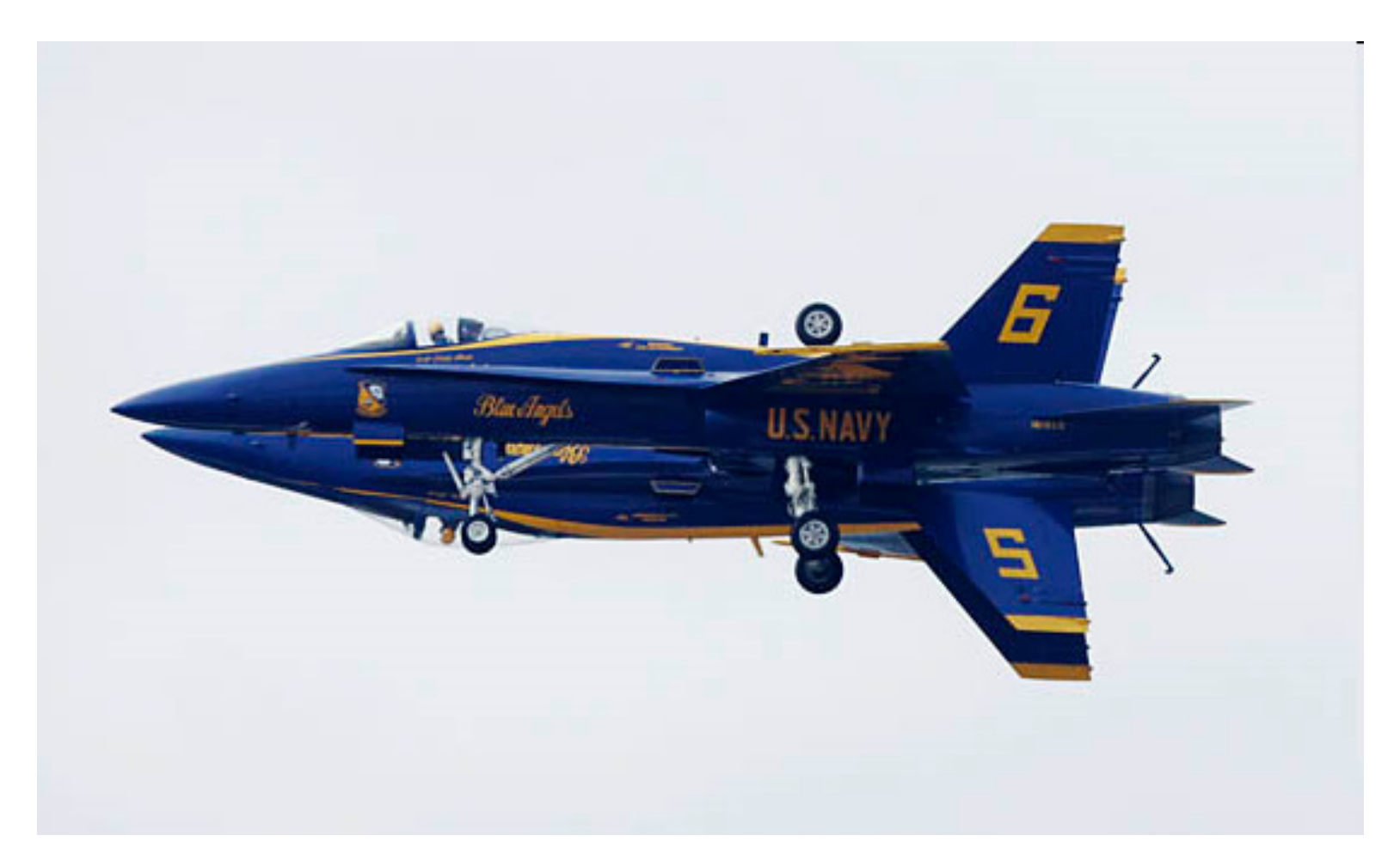
The U.S. Navy Blue Angels