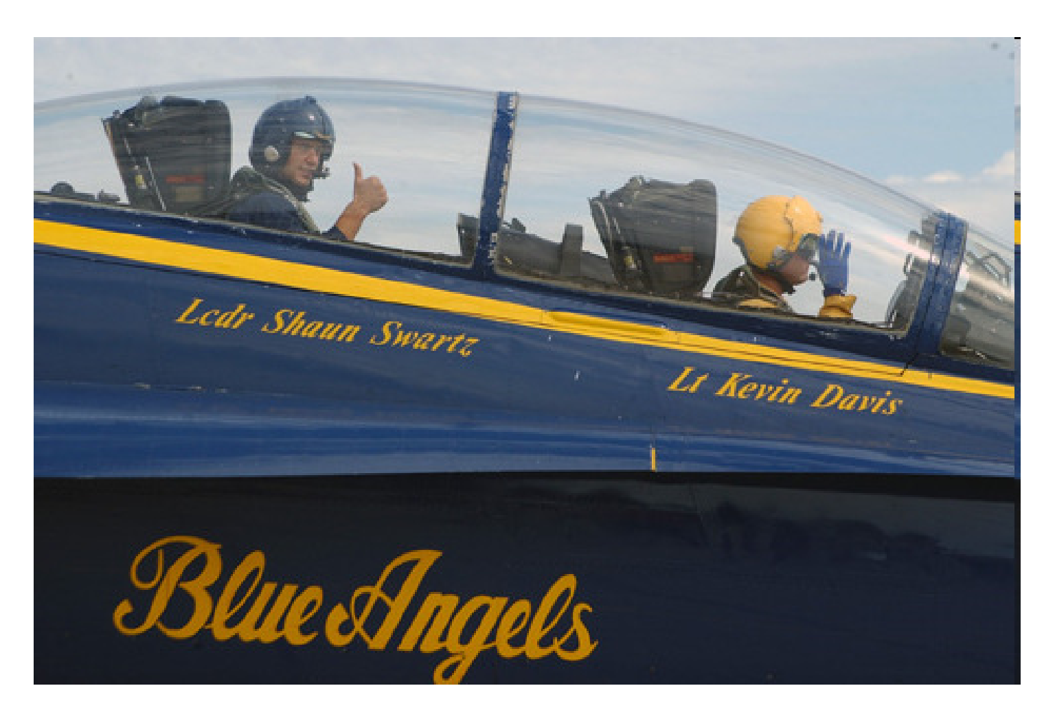
The U.S. Navy Blue Angels