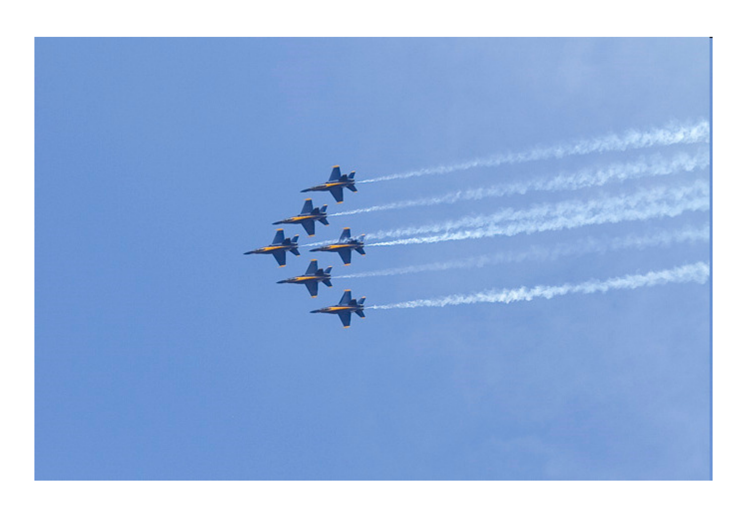
The U.S. Navy Blue Angels