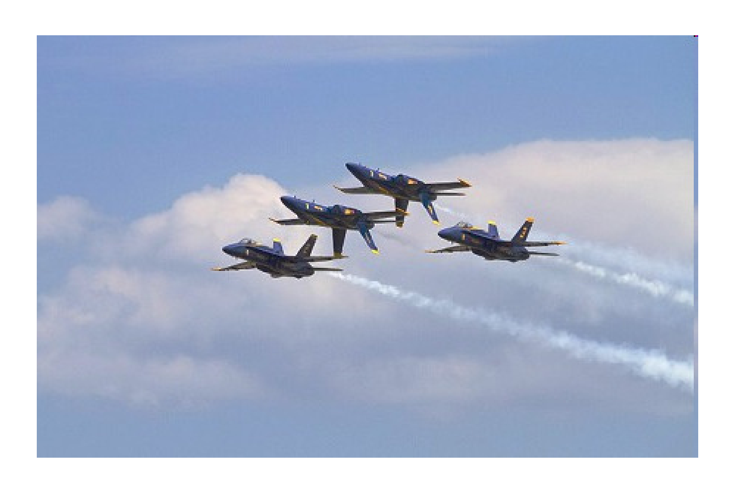
The U.S. Navy Blue Angels