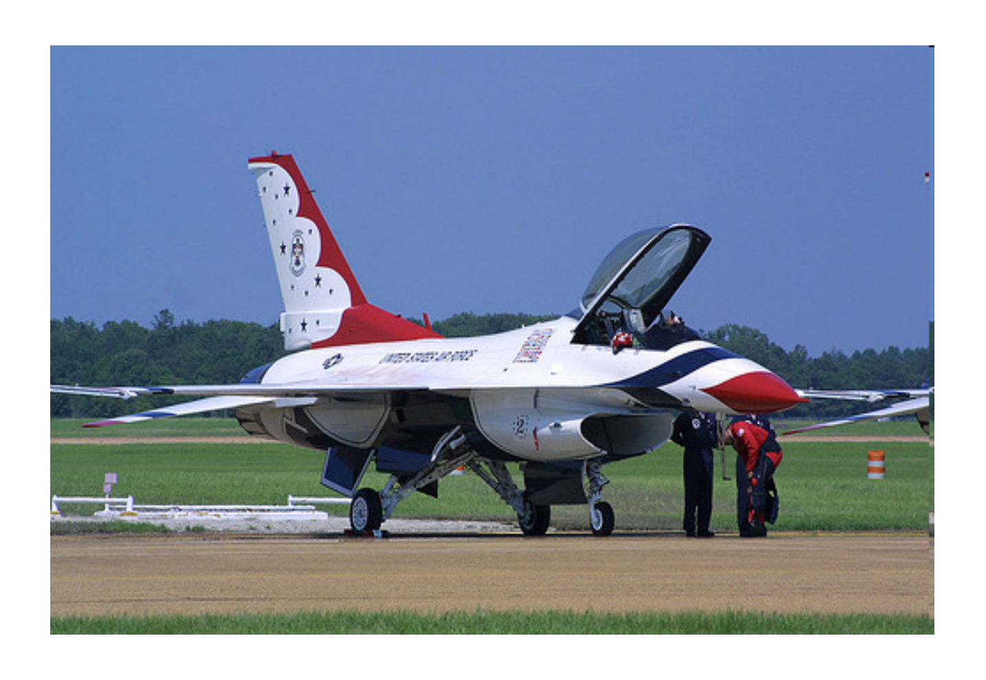
The U.S. Air Force Thunderbirds