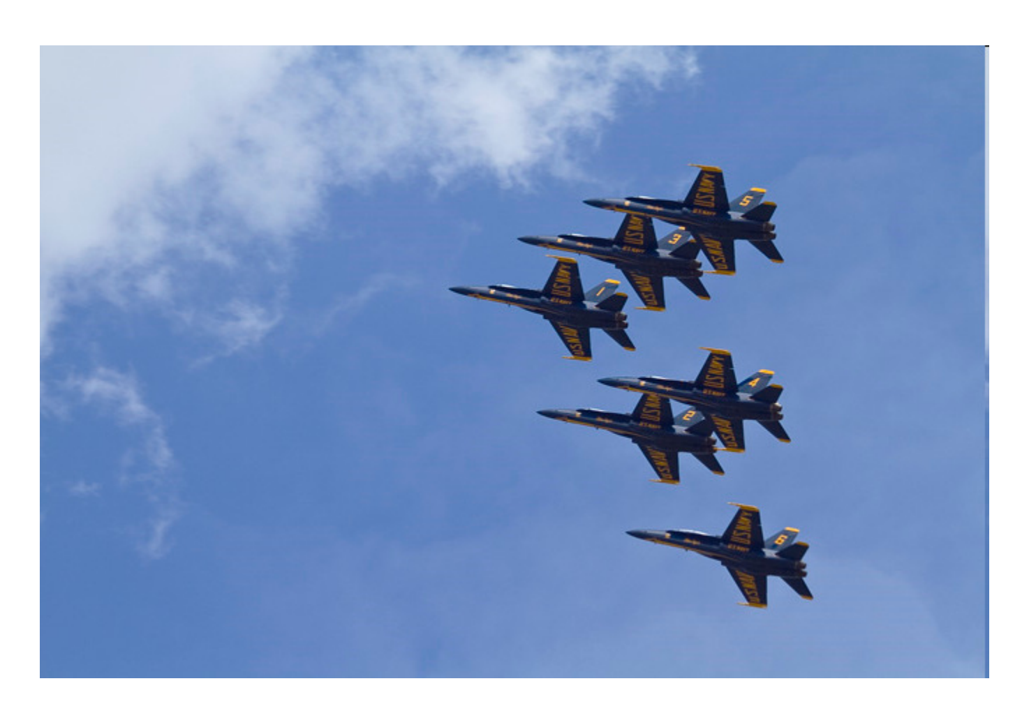
The U.S. Navy Blue Angels