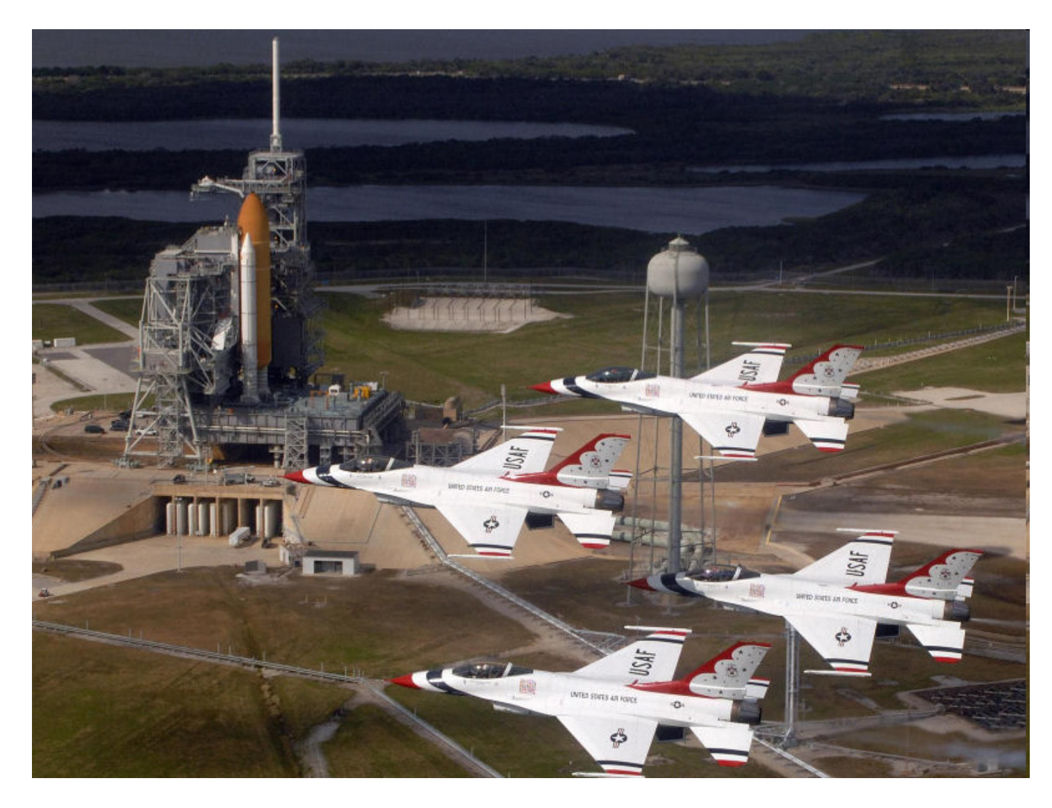
The U.S. Air Force Thunderbirds perform a special maneuver