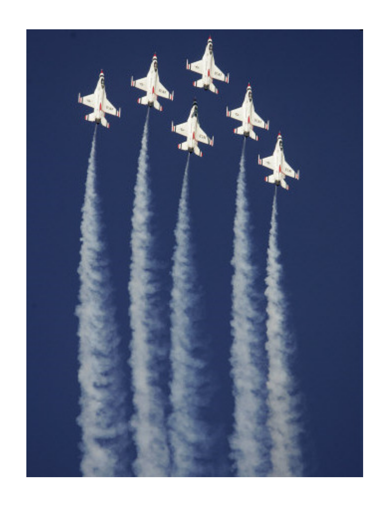
The U.S. Air Force Thunderbirds perform a special maneuver