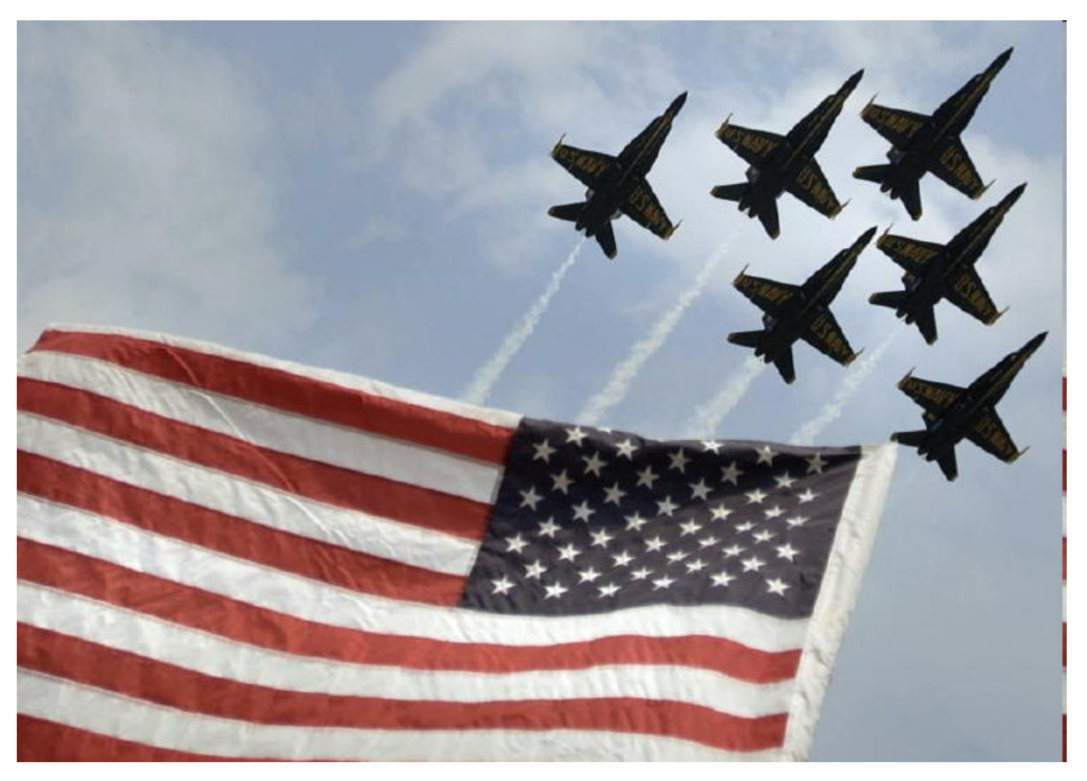
The U.S. Navy Blue Angels