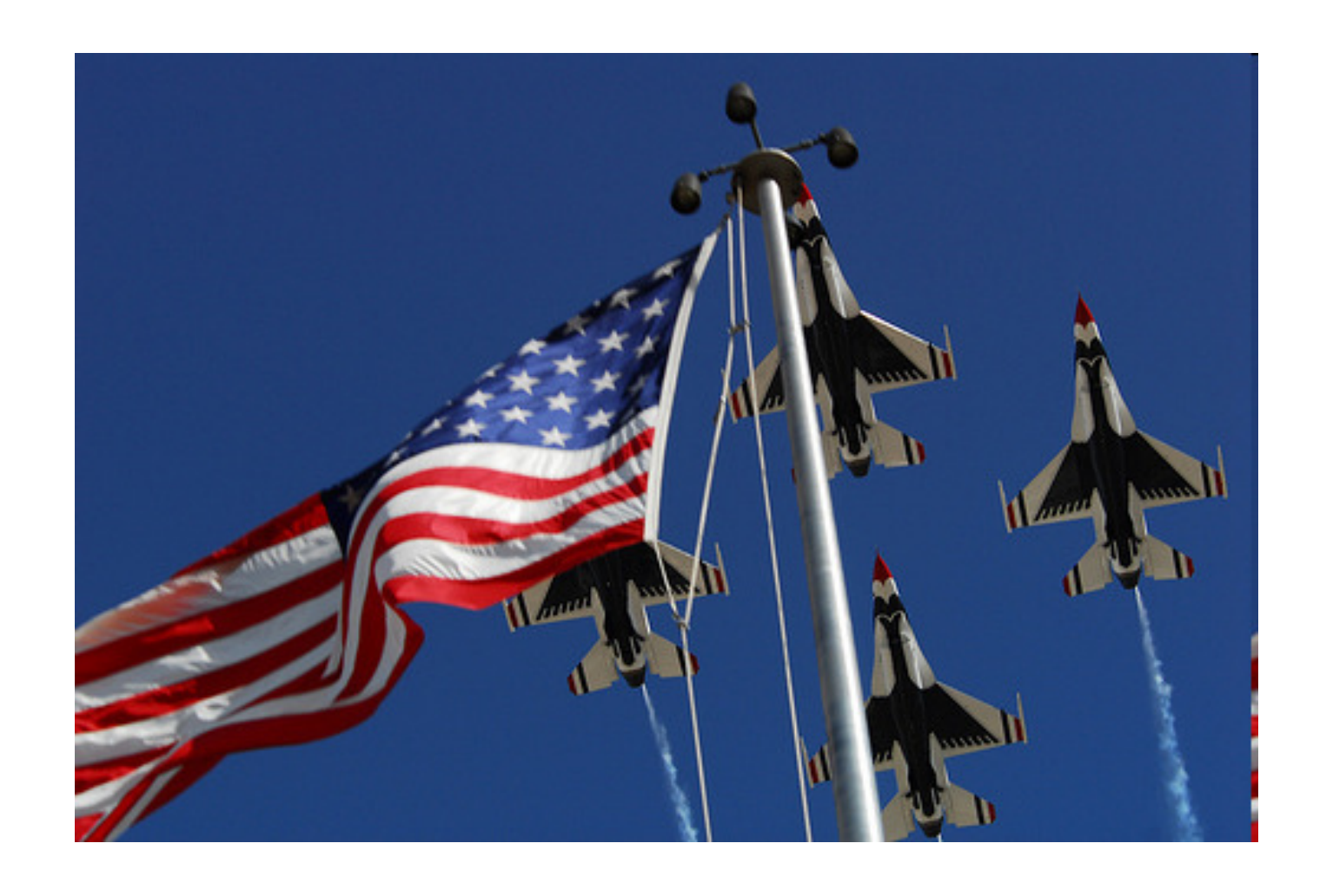
The U.S. Air Force Thunderbirds perform a special maneuver