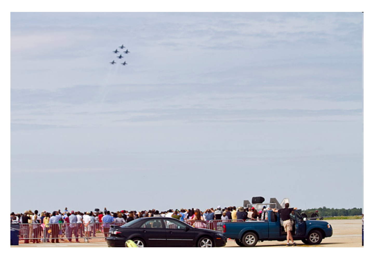
The U.S. Navy Blue Angels