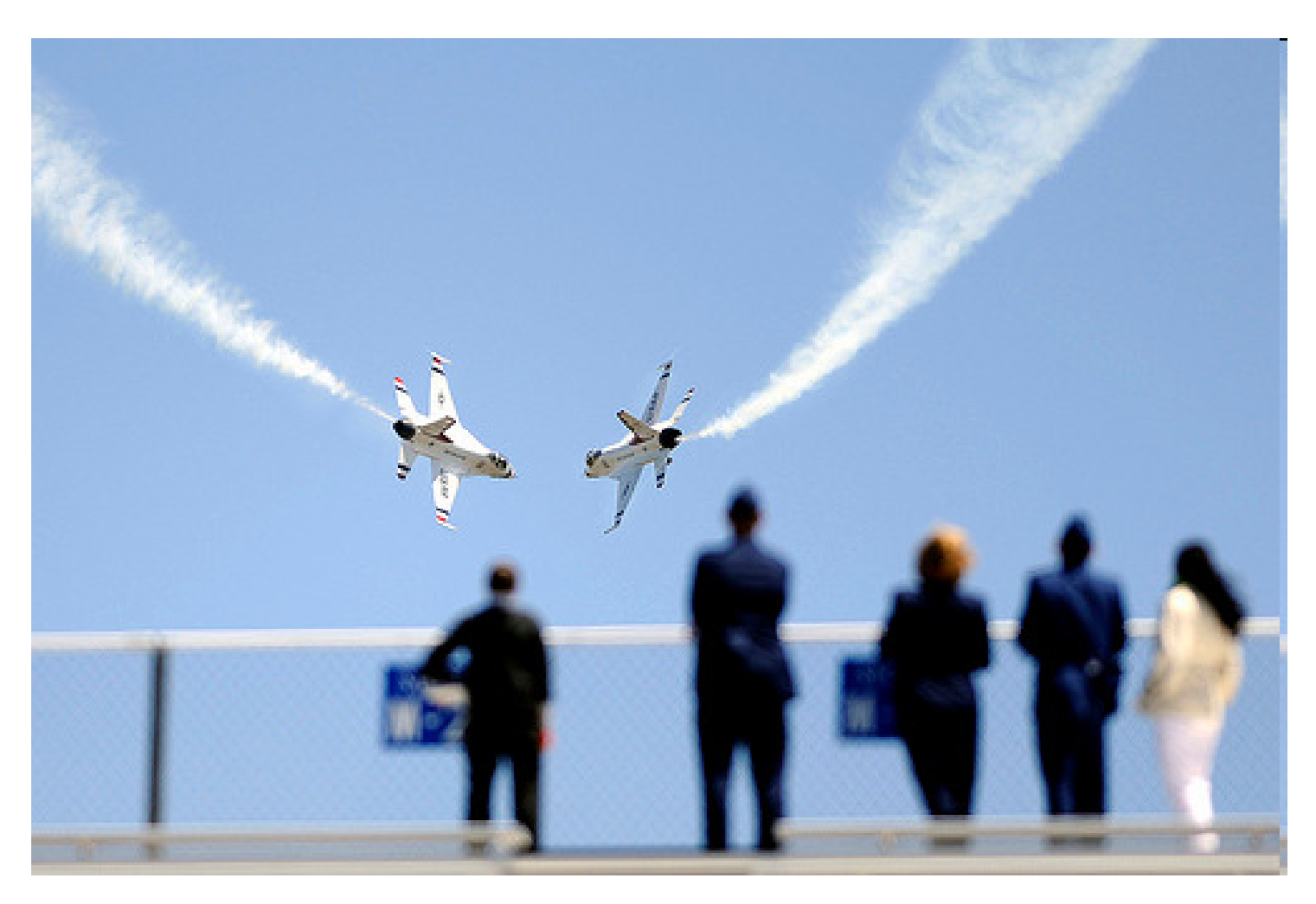
The U.S. Air Force Thunderbirds perform a "reflection" maneuver